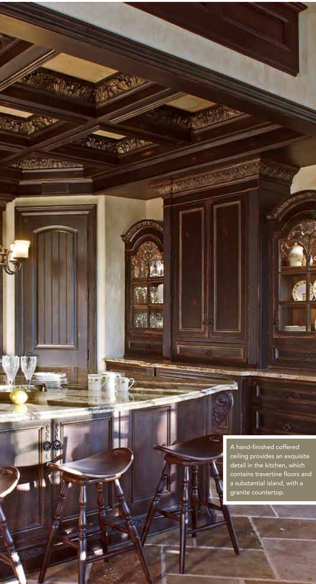
A hand-finished coffered ceiling provides an exquisite detail in the kitchen, which contains travertine floors and a substantial island, with a granite countertop.

carrying through with the original plan.” With all of the dark trim, her clients thought it was important for the wall treatments to stay on the lighter side. “I did not want the contrast to be too stark,” Nastro says. “We compromised on just the right plaster treatment with a warmer color, which proved to be just right.”