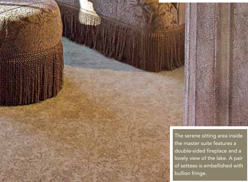
The serene sitting area inside the master suite features a double-sided fireplace and a lovely view of the lake. A pair of settees is embellished with bullion fringe.

who was inspired by a fabric pattern that was enlarged for the look.